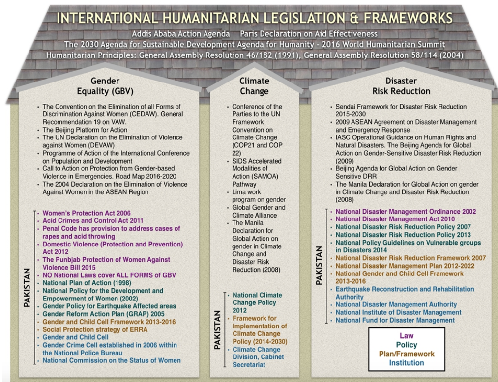
Figure 1: Global and National Polices Landscape in Pakistan.

As the graphic below shows, the Government of Pakistan has ratified the Universal Declaration of Human Rights of 1948, the United Nations Convention on the Rights of the Child and the United Nations Convention on the Right of Persons with Disabilities. They have adhered to the Convention on the Elimination of all Forms of Discrimination Against Women (CEDAW); endorsed the Sendai Framework Disaster Risk Reduction 2015-2030; the Agenda for Humanity, the Paris Declaration of Aid Effectiveness, the 2030 Sustainable Development Goals (SDG), and have adopted the Programme of Action of the International Conference on Population and Development. In addition, on 10 November 2016 Pakistan ratified the Paris Agreement on Climate Change (COP21).